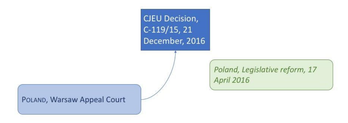
Fig. 3.1, Biuro